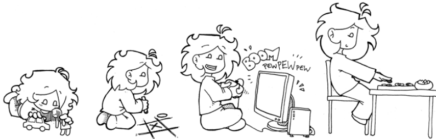
The Evolution Of Playing.

Peter Norvig, Stuart Russell: Artificial Intelligence: A Modern Approach, 3rd Edition 2009. De facto standard textbook on AI.